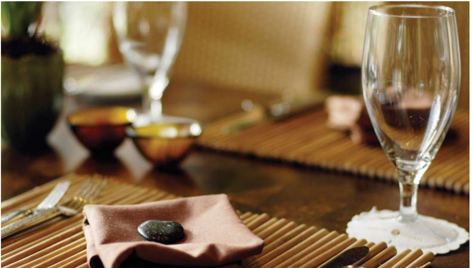
Elegant place settings of Esplanade Bistro are ready for the Friday night dinner crowd.