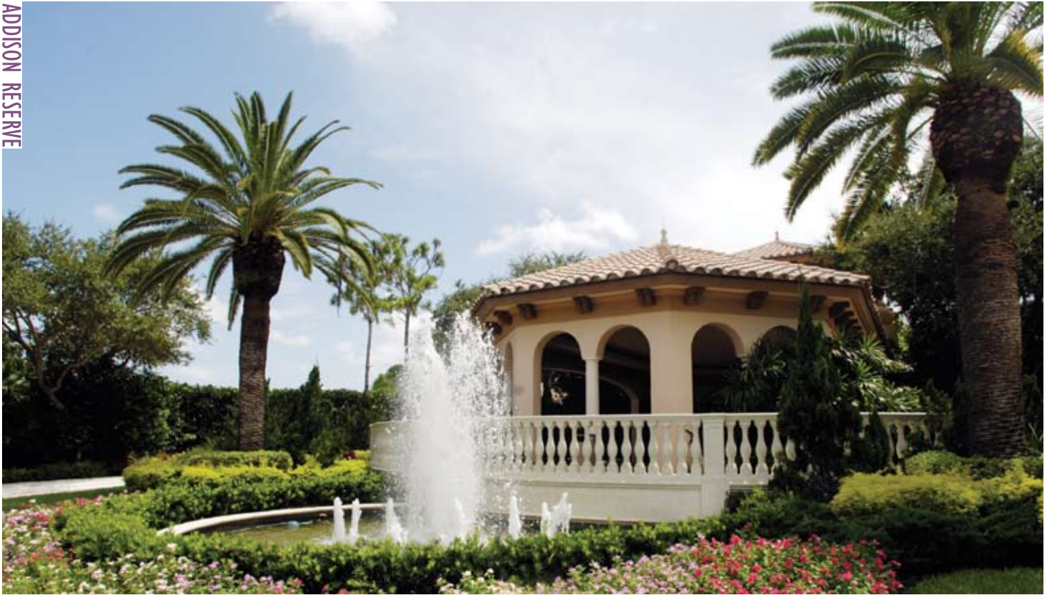
Tropical Florida landscape at the front entrance to the Club House of Addison Reserve Country Club. LINDSAY MOORE