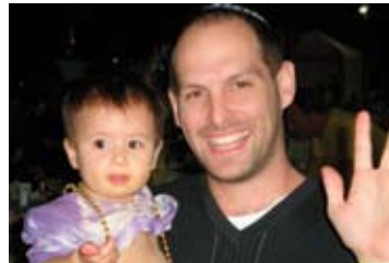
Smiles at New Year's Eve Street Fair