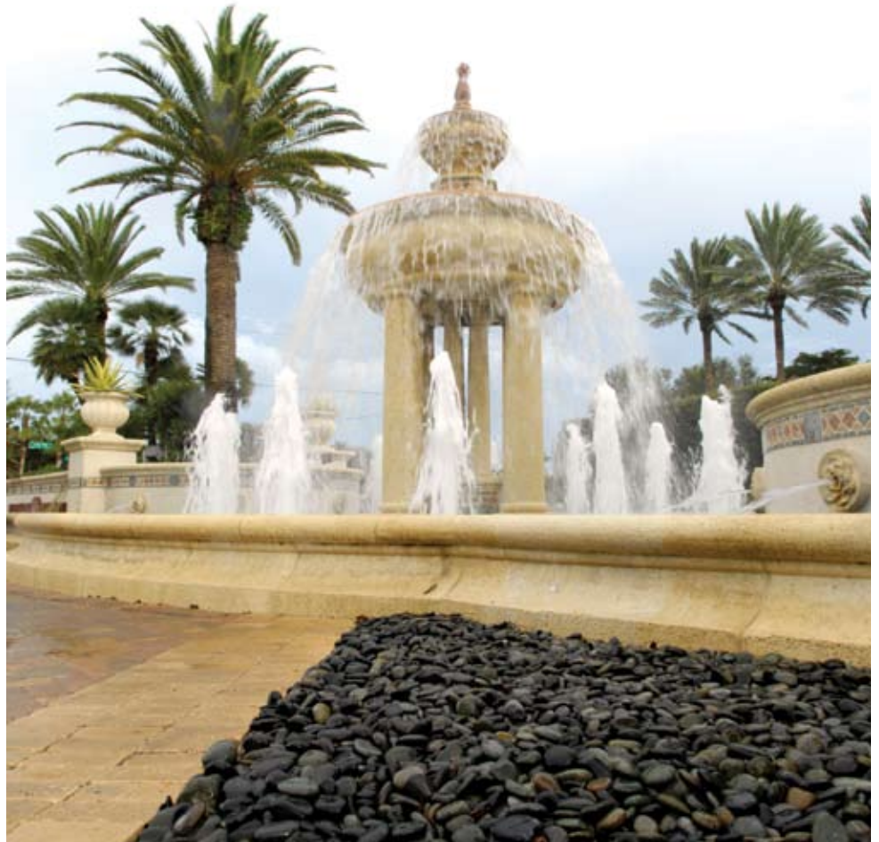
A fountain greets members and guests before reaching the security-gated front entrance of Addison Reserve Country Club.

The club’s 27-hole, Arthur Hills-designed golf course was built in the mid-1990s and