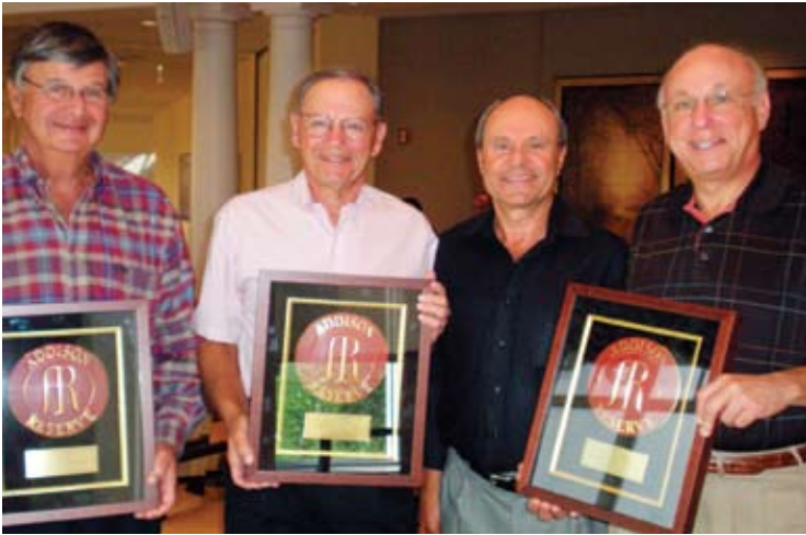
Club leaders show off awards