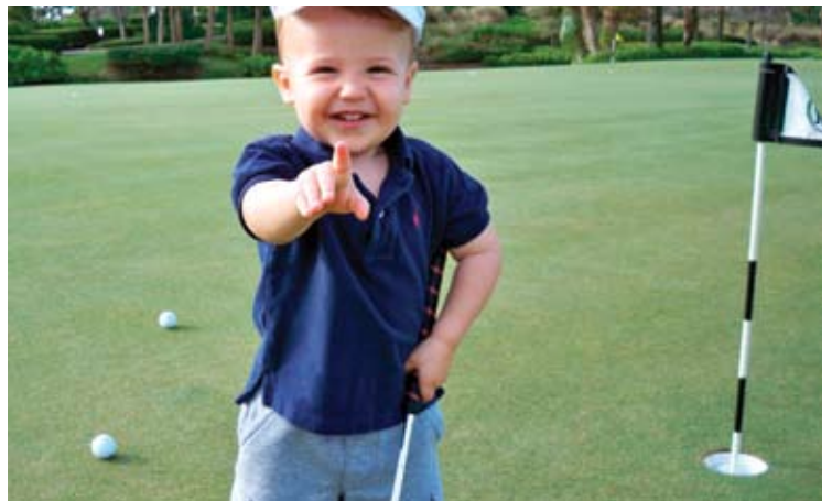
Future golf member