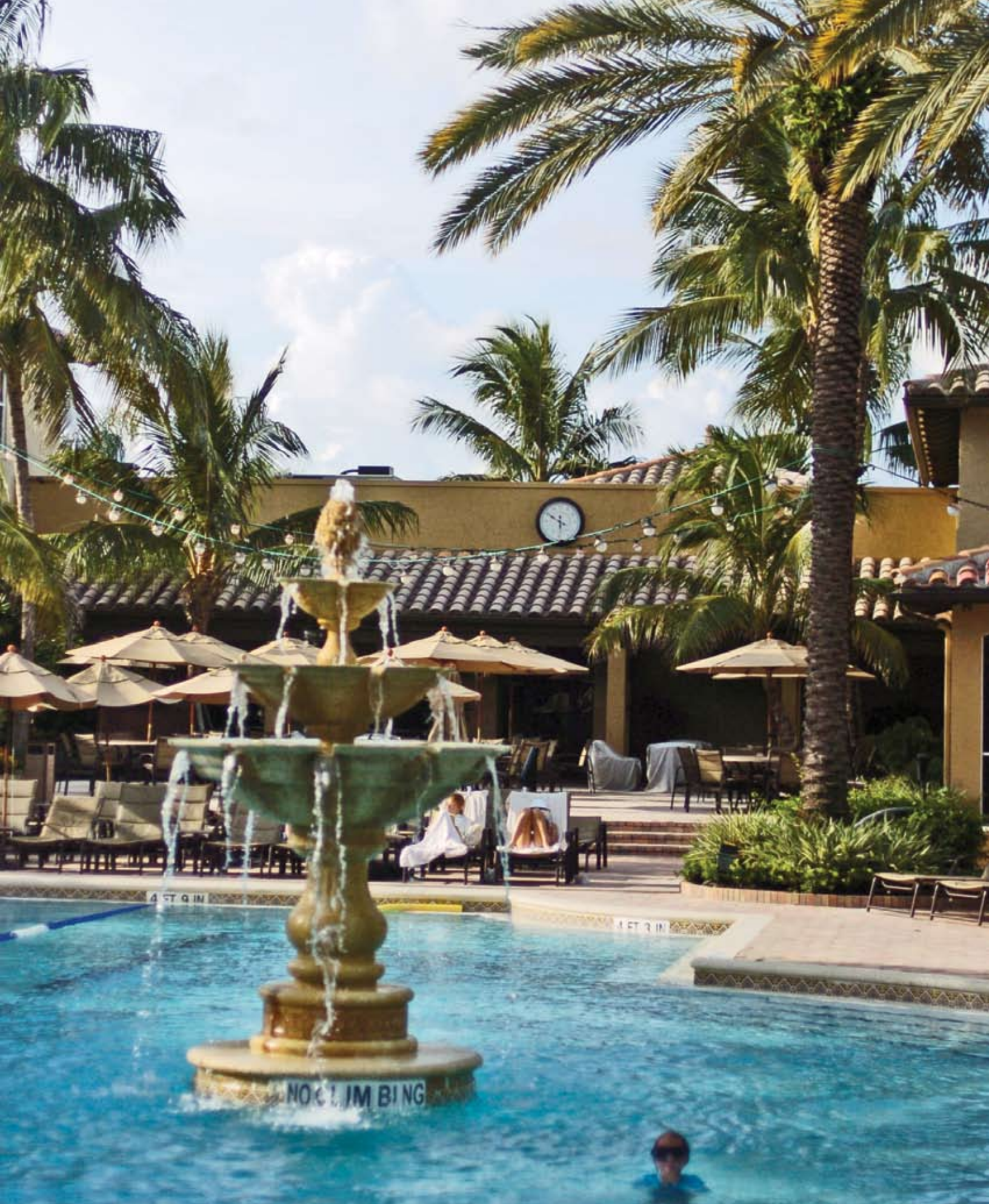
The Spa (background) overlooks the Addison Reserve Country Club's Esplanade swimming center as members lounge by the pool and play in the water.