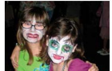
Faces painted to welcome new year