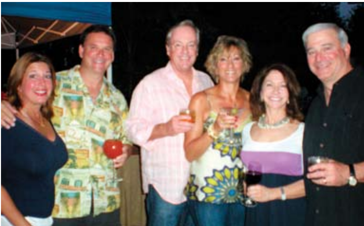
Club members celebrating together