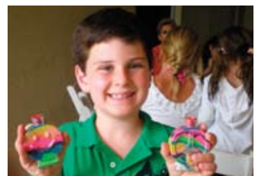
Creativity with sand art