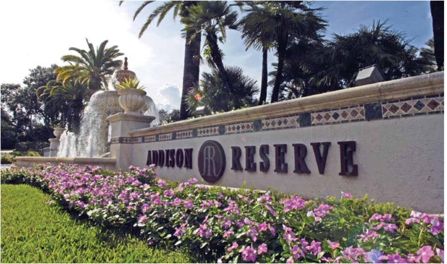
The entrance of Addison Reserve Country Club on Jog Road. LINDSAY MOORE