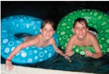
Dive-In Movie Night