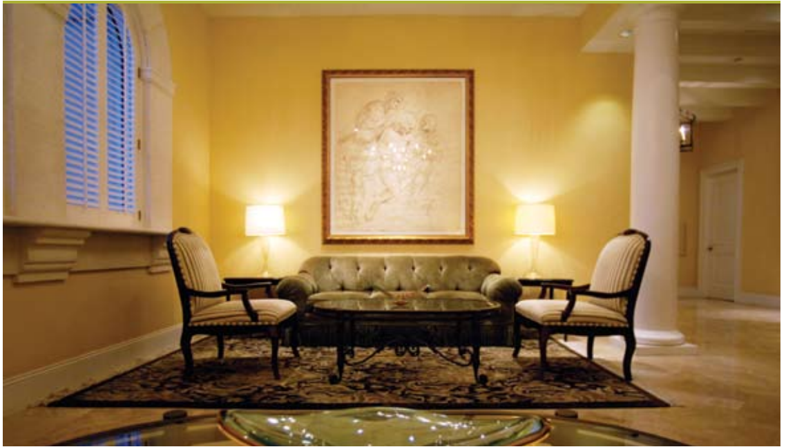
A comfortable lounge seating area is available for members and guests in the Club House at the Addison Reserve Country Club.