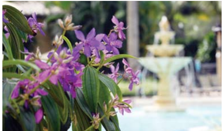
Esplanade's swimming center.

And it's a children's activity center that's staff run and full