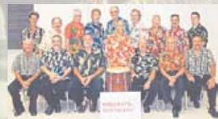
ORQUESTA NOSTALGIA Oct. 4 at 2 pm

$17 Single Ticket – $45 Series Package Discount