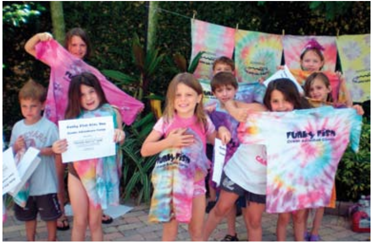
Funky Fish Kids Adventure