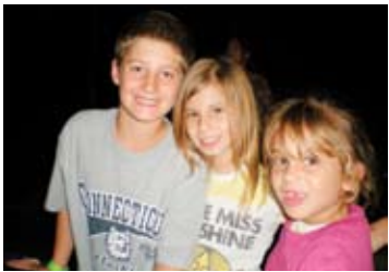
New Year's Eve Street Fair