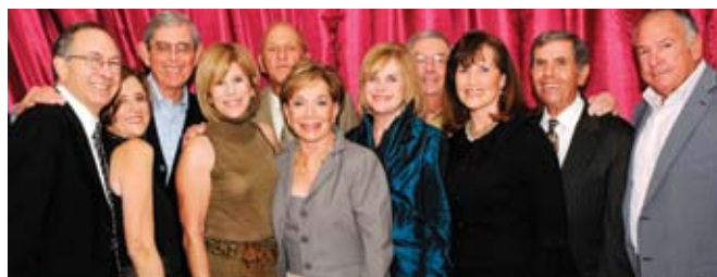
Club members together for a cause