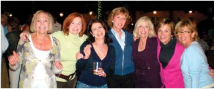
The ladies of Addison Reserve