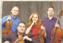
AMERNET STRING QUARTET Dec. 13 at 2 pm