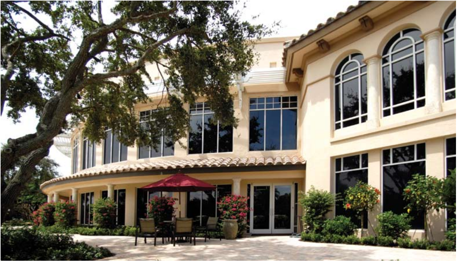
Tropical landscaping surrounds the back patio tables that overlook the practice putting green behind the Club House. MATT DEAN