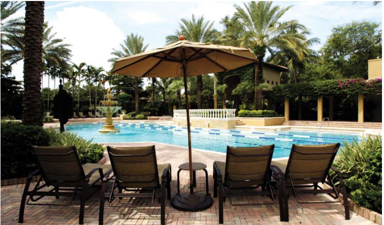
Lounge chairs and umbrellas surround the Esplanade's Mediterranean style junior Olympic swimming pool. LINDSAY MOORE