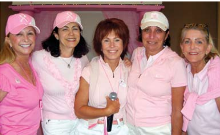
Pink ladies raising money for cancer