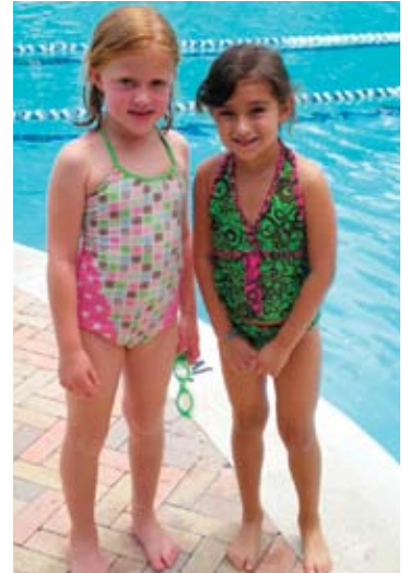
Pool time for these bathing beauties