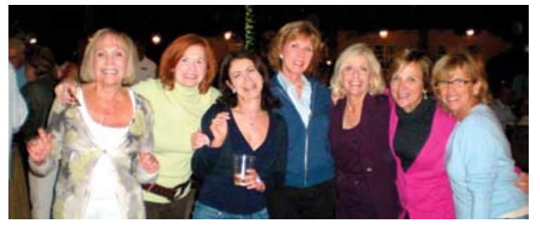
The ladies of Addison Reserve