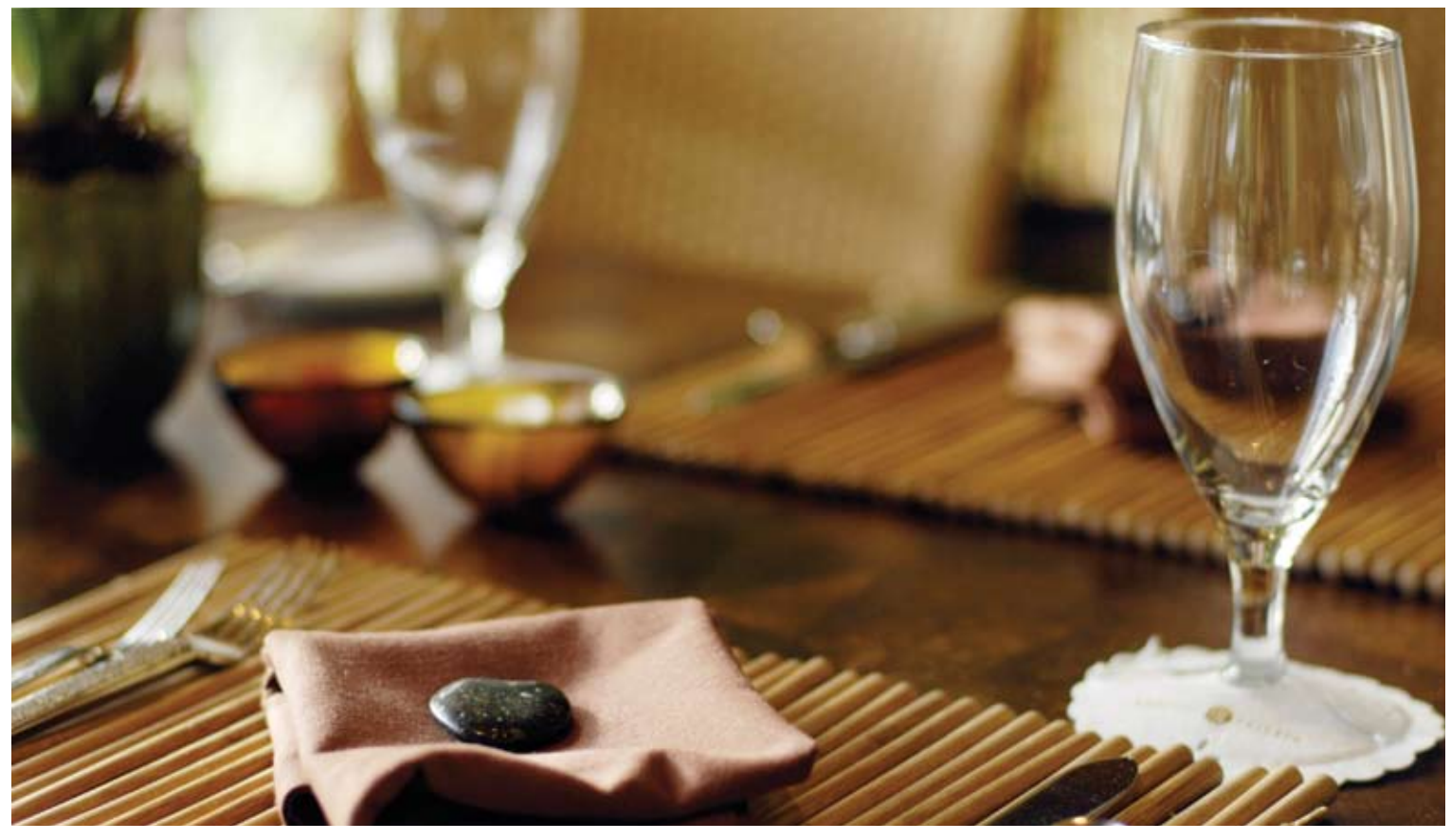
Elegant place settings of Esplanade Bistro are ready for the Friday night dinner crowd. LINDSAY MOORE