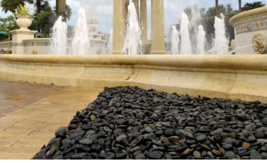
A fountain greets members and guests before reaching the security-gated front entrance of Addison Reserve Country Club.