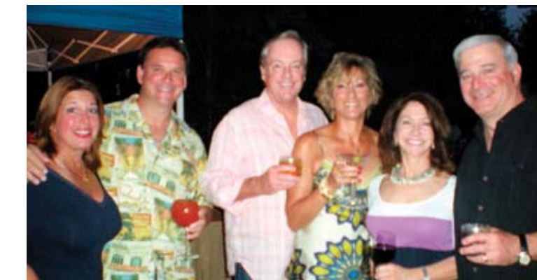
Club members celebrating together