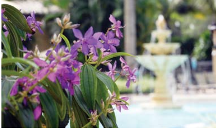
Esplanade's swimming center. MATT DEAN

And it's a children's activity center that's staff run and full