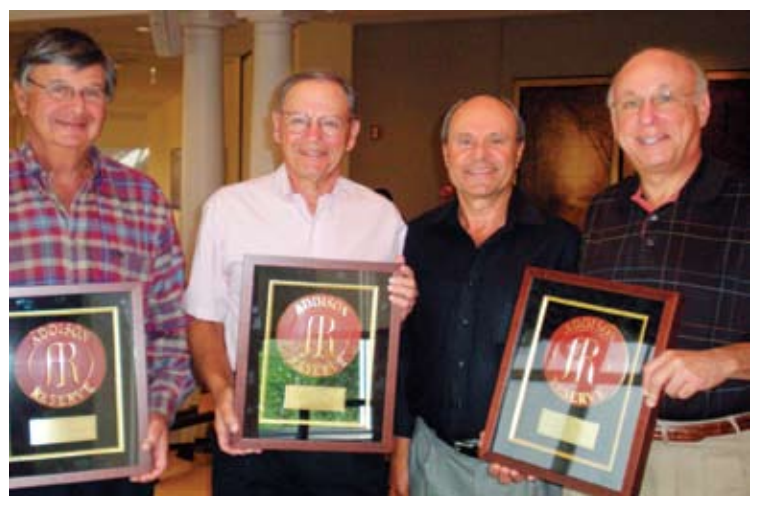
Club leaders show off awards