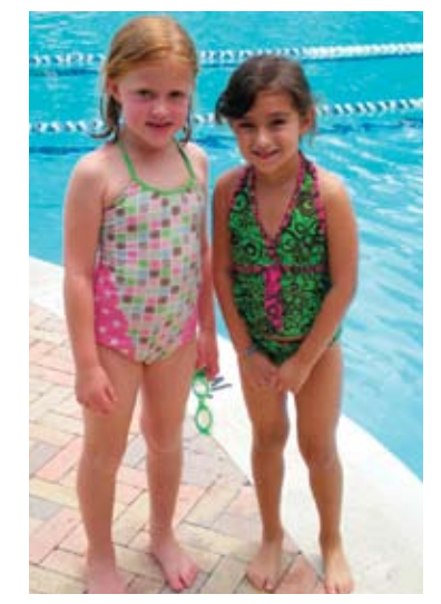
Pool time for these bathing beauties