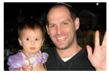
Smiles at New Year's Eve Street Fair