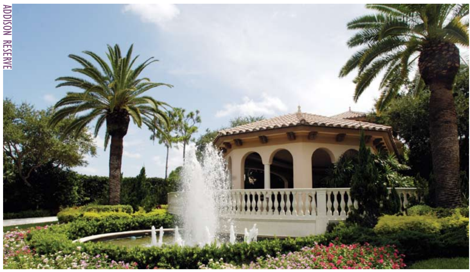
Tropical Florida landscape at the front entrance to the Club House of Addison Reserve Country Club. LINDSAY MOORE